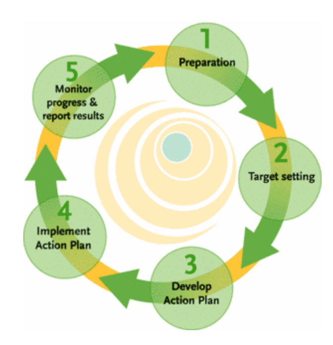
FIGURE 1 Overview of the Procura<sup>+</sup> Milestone Process

The Procura<sup>+</sup> Milestone process is designed with flexibility in mind-applicable for any public authority no matter its size or structure. Each step can be applied as concisely or comprehensively as required. For example: